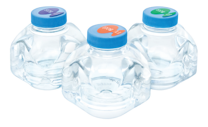
Image 1. Aquavive® pre-filled 300mL mouse water bottle options. Available with acidified (orange), chlorinated (green) or ultra-pure (purple) water.