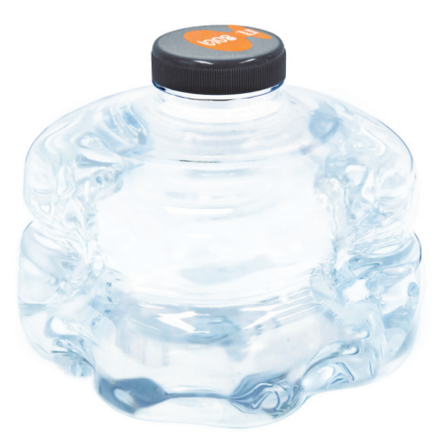
Image 2. Aquavive<sup>®</sup> pre-filled 850mL rat water bottle. Available with acidified or chlorinated water