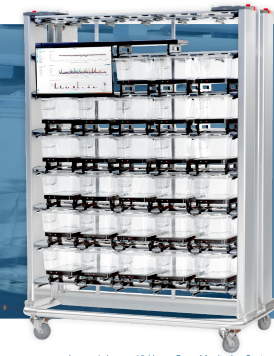
Image 1. Innorack® Home Cage Monitoring System with Matrix Plates and Optional Monitor